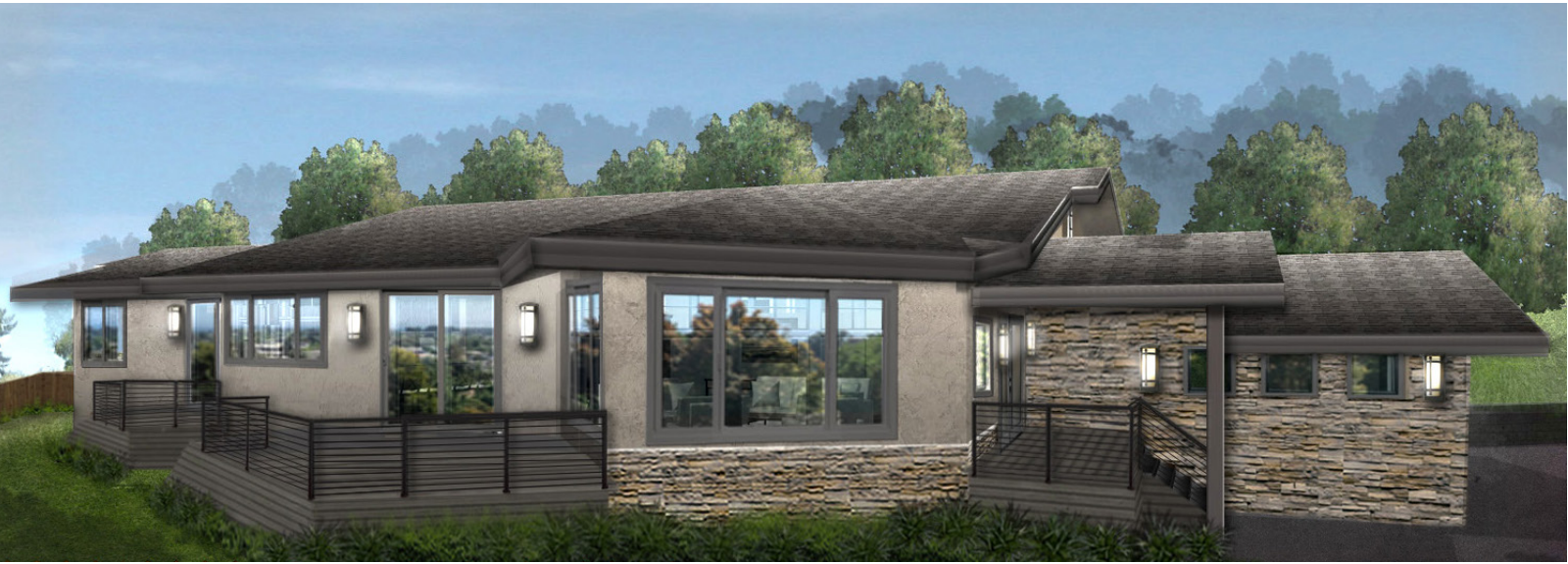
Off-street privacy on a short private driveway shared with one neighbor. Private large yard area on the backside of house perfect for gardening and entertaining family and friends